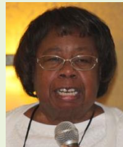
2015 Past Sectional Director