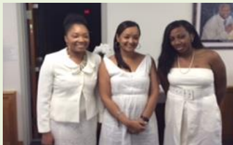
Inducted November 15, 2015