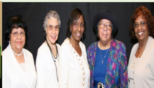
Getting ready for a Branch Meeting 2010