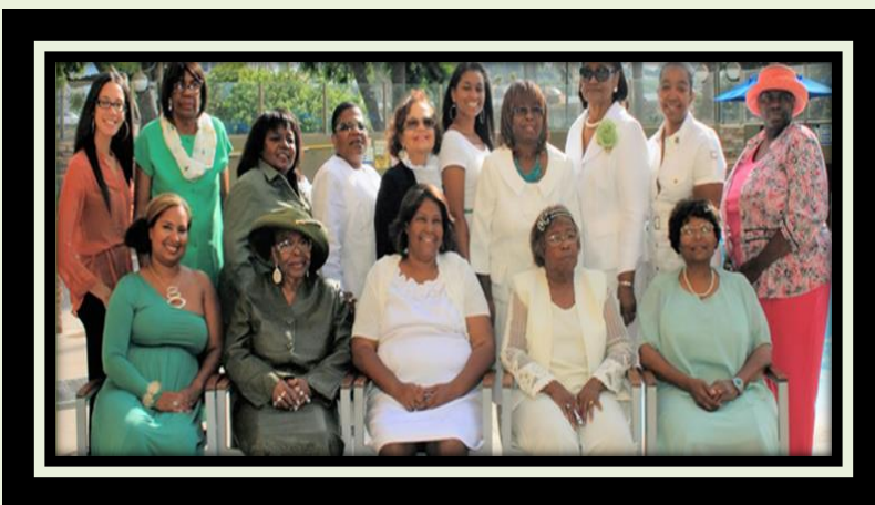
Santa Monica Branch Members