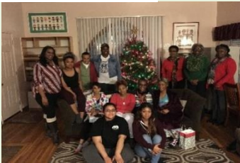
Members at Dangerfield Institute Girls Group Home Christmas Gift Exchange Program.