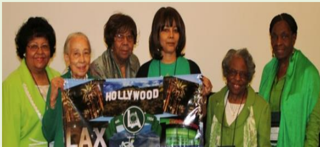
Celebrating the 2014 National Conference in New Orleans