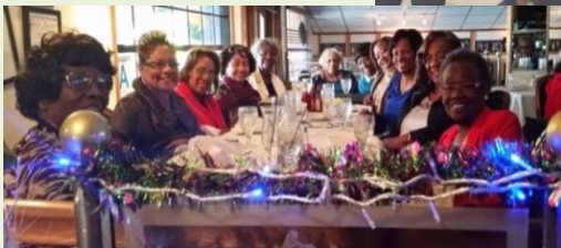
Culver City end the 2015 year with a Holiday Gathering and This years' community outreach gift was donating socks to PATH