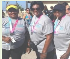
Culver City Stars Together Supports the fight against Ovarian and Breast Cancer.