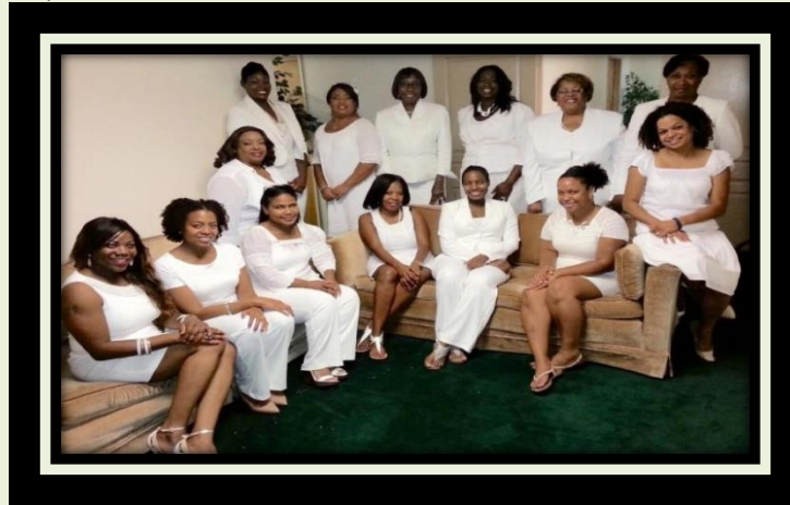
Beach Cities Members: