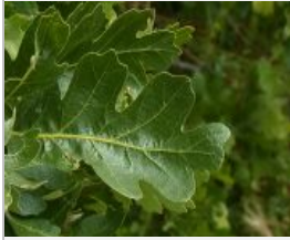
Oak tree leaves and branches