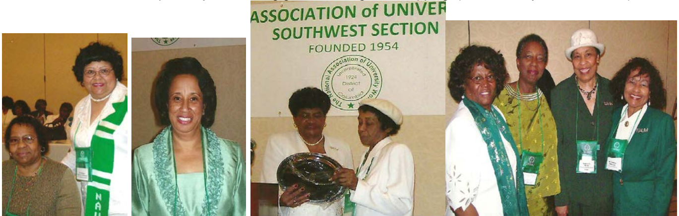
More photo highlights from February 5-6, 2010 Sectional Conference above and below!