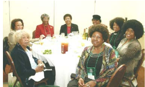
Don't you just love the 1960s/ Members at the Friday night dinner/dance