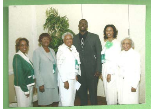
Scholarship Committee with scholarship Master Degree Winner