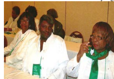
Santa Monica Branch members at 1 st Plenary Session