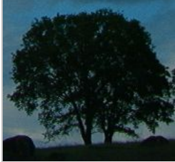
Like and oak tree with its ... growing STRONGER every day...

We thank all of the Branches for their continued support to give scholarships to youth. We gave over forty four thousand dollars ($44,000) in scholarship aid from our section. The Los Angeles Branch leads the way with more than eighteen thousand dollars given in scholarship aid to the community. A special thank you to the branches for their one hundred dollar donations to the Sectional Scholarship Fund. One Thousand dollars ($1,000) was given to our college Recipient this year.