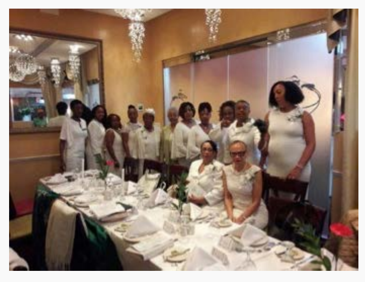
The Rockaway – Jamaica Branch – Chartered on March 4, 2017