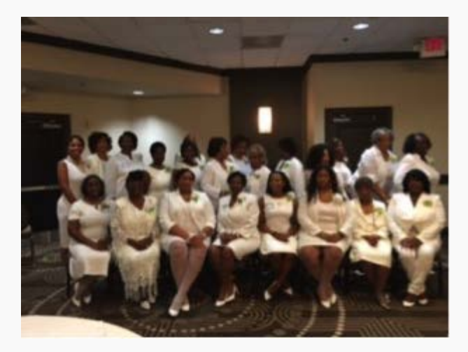
South Harris County Branch - Chartered on August 27, 2016

North Texas Branch - Chartered on October 29, 2016